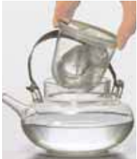
Setup the ice holder.

※ If the spout is damaged, repairs are possible.