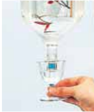
Push up on the knob.